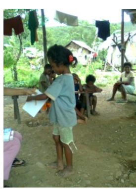
Here some of the younger students are seen receiving their writing books, no gloom here!