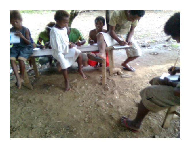
There are many ways how to work. The lack of chairs and tables hinders none from doing their school work.

She went only to second degree, but now she aim to finish elementary in spite of being too old for a class in the Elementary School.